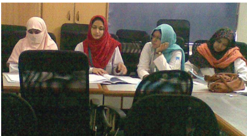
Views of the training workshop on child protection, early detection and management of child abuse held at DUHS