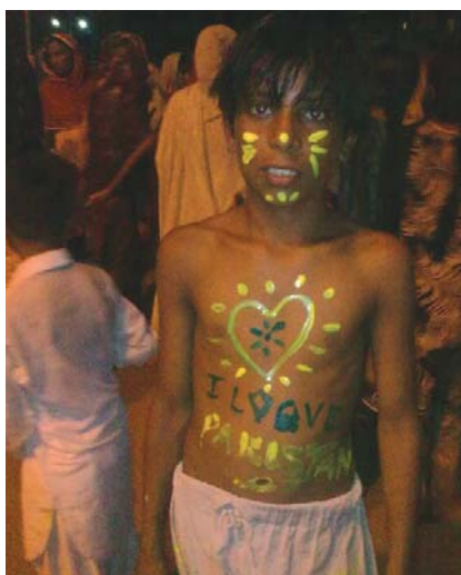
Child at eid mela