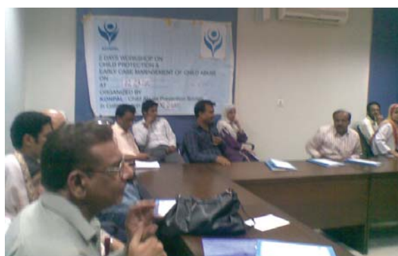
Workshop organised for doctors at Dow University of Health Sciences.