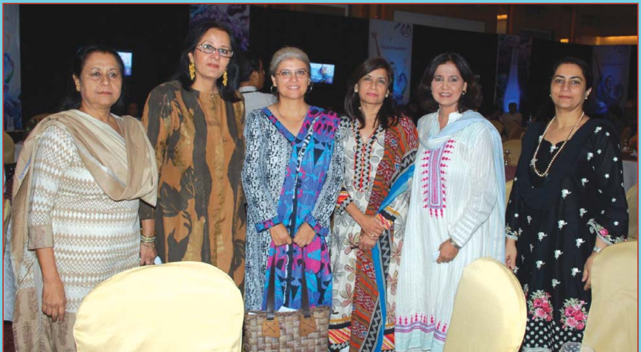
Konpal collaborated with Child Rights Group of PPA and Body Shop in their campaign against Child Trafficking. The seminar and signature campaign were held in November 2010 on the occasion of Universal Children Day.