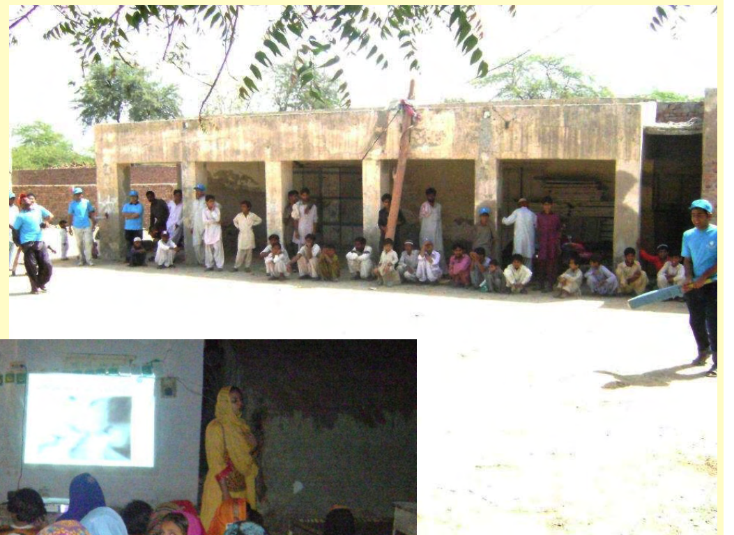
KONPAL and Waris members, Volunteers and

On 24th March a Health Walk was organized at Badin over 500 children